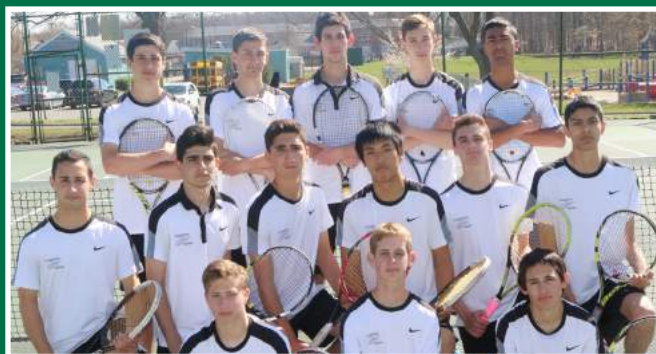
BOY'S VARSITY TENNIS