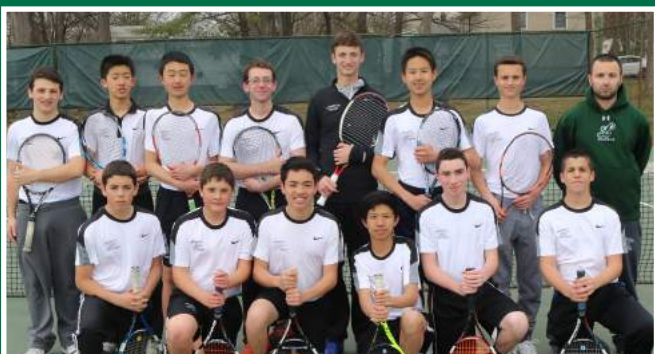
BOY'S JUNIOR VARSITY TENNIS