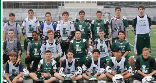
BOY'S JUNIOR VARSITY LACROSSE