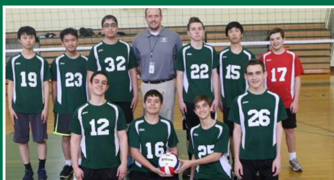
BOY'S FRESHMAN VOLLEYBALL