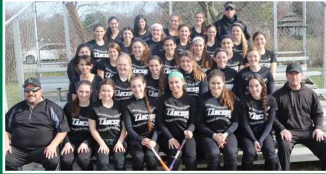
GIRL'S VARSITY SOFTBALL