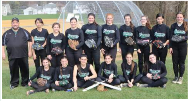
GIRL'S JUNIOR VARSITY SOFTBALL