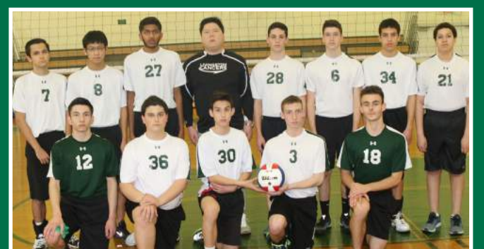
BOY'S JUNIOR VARSITY VOLLEYBALL