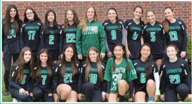
GIRL'S FRESHMAN LACROSSE