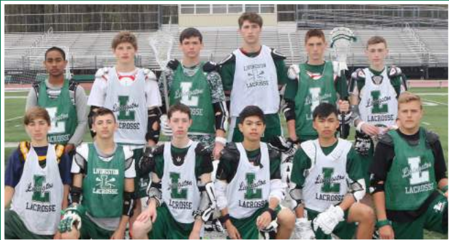
BOY'S FRESHMAN LACROSSE