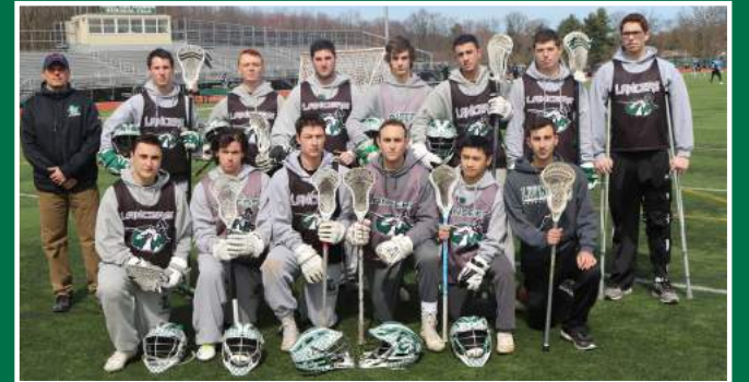
BOY'S VARSITY LACROSSE