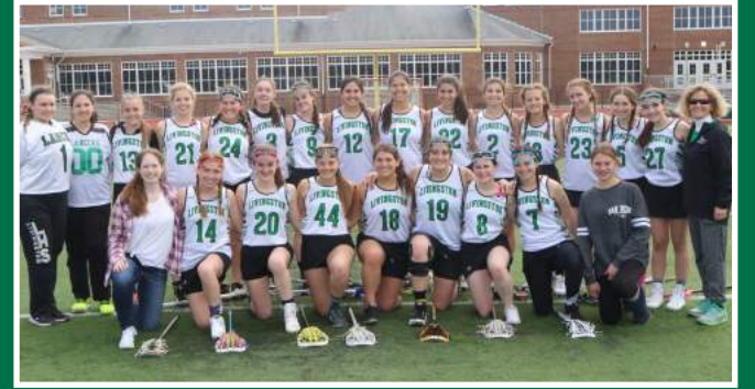
GIRL'S VARSITY LACROSSE