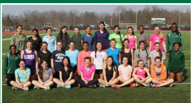
GIRL'S TRACK AND FIELD