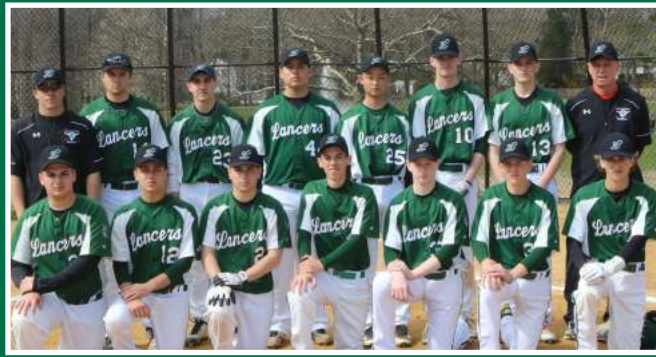
BOY'S JUNIOR VARSITY BASEBALL