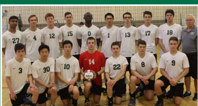
BOY'S VARSITY VOLLEYBALL