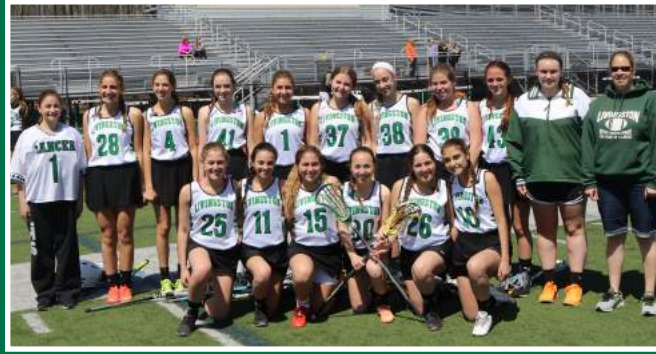
GIRL'S JUNIOR VARSITY LACROSSE