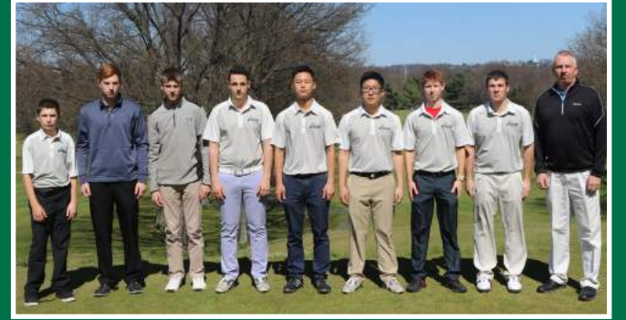
BOY'S VARSITY GOLF