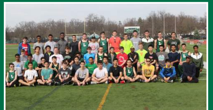
BOY'S TRACK AND FIELD