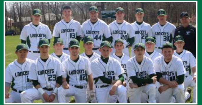
BOY'S VARSITY BASEBALL